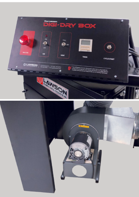
High Output HVAC Blower